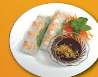
Fresh Basil Roll

320 Town Center Avenue, Suite C-8 Suwanee, GA 30024 (At Suwanee City Hall)